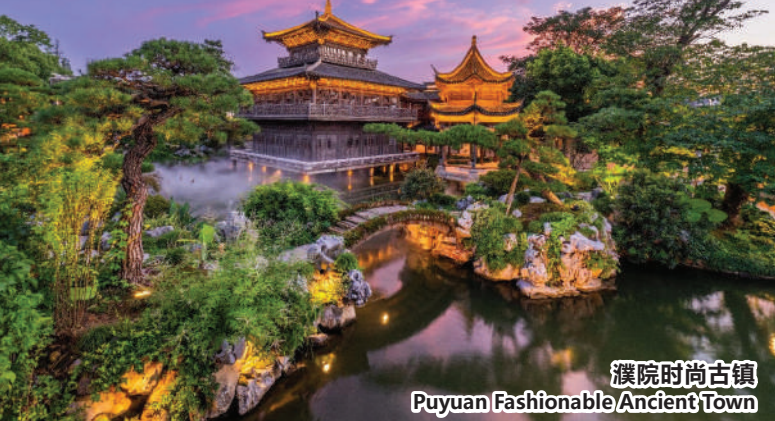
濮院时尚古镇 Puyuan Fashionable/Ancient Town