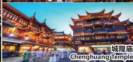
城隍庙 Chenghuang Temple