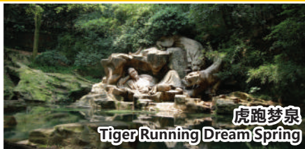
虎跑梦泉 Tiger Running Dream Spring