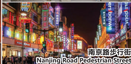
南京路步行街 Nanjing Road Pedestrian Street