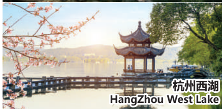
杭州西湖 HangZhou West Lake