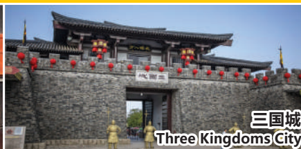
三国城 Three Kingdoms City